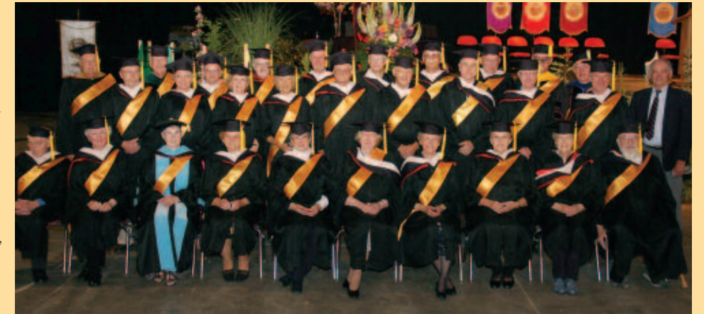
Class of 1956 (Golden Grads of 2006) pictured above may be viewed with names online at nnu.edu/alumni .